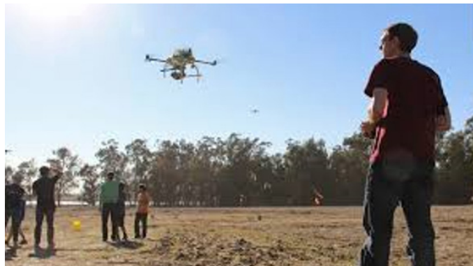
Figure 14: UAV flying