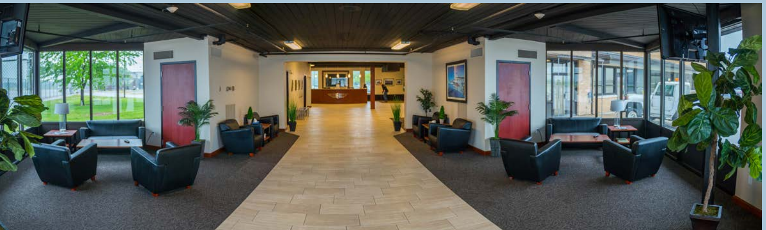
Figure 5: Hoosier Aviation's sitting area