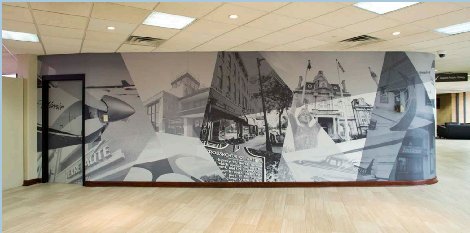
Figure 9: Community Canvas Wall