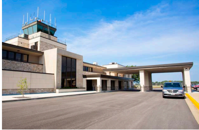
Figure 26: Terminal after renovations, completed in 2017