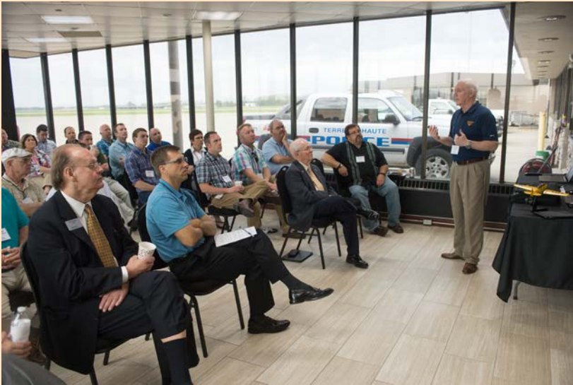
Figure 15: AI Quarterly Meeting

a standing committee of the Terre Haute Chamber of Commerce who volunteer their time to provide a crucial link between the Chamber and its members by ensuring they are maximizing the benefits of their investment. They assist with retention through positive and professional interaction with members.