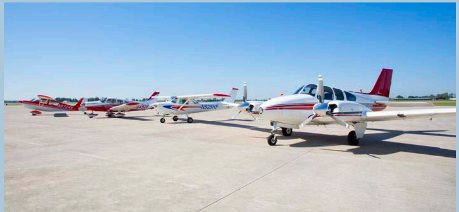
Figure 2: Hoosier Aviation's Fleet