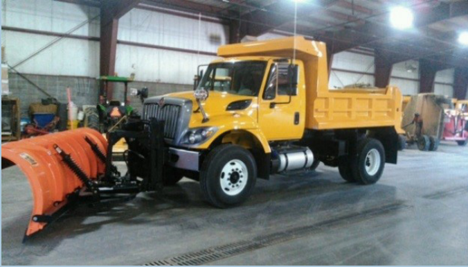
Figure 24: New Oshkosh H series snow plow