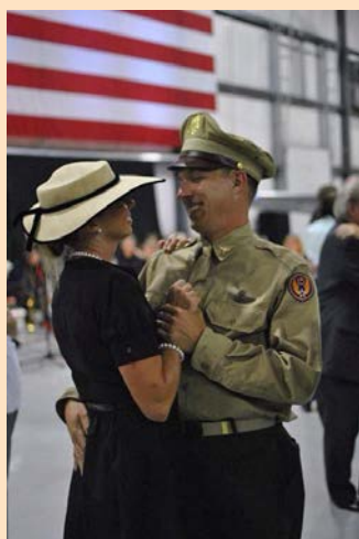
Figure 20: Hangar Dance