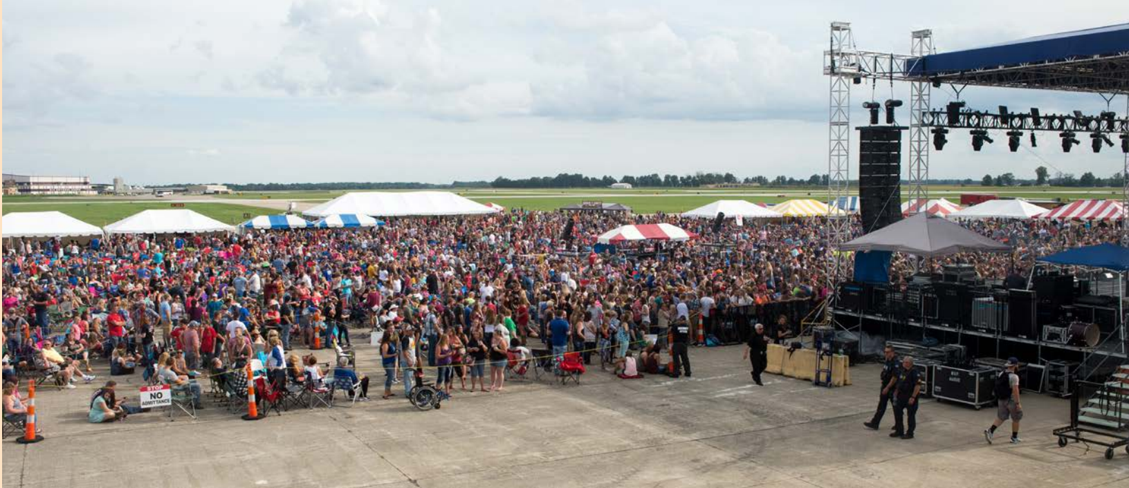
Figure 18: HI-99 Complete Outdoor Off the Tracks Music Jam