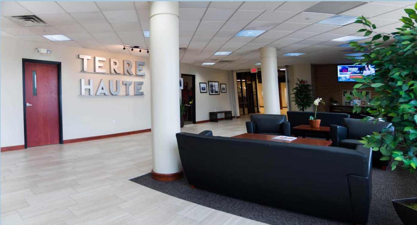
Figure 8: Terre Haute sign from the original terminal building