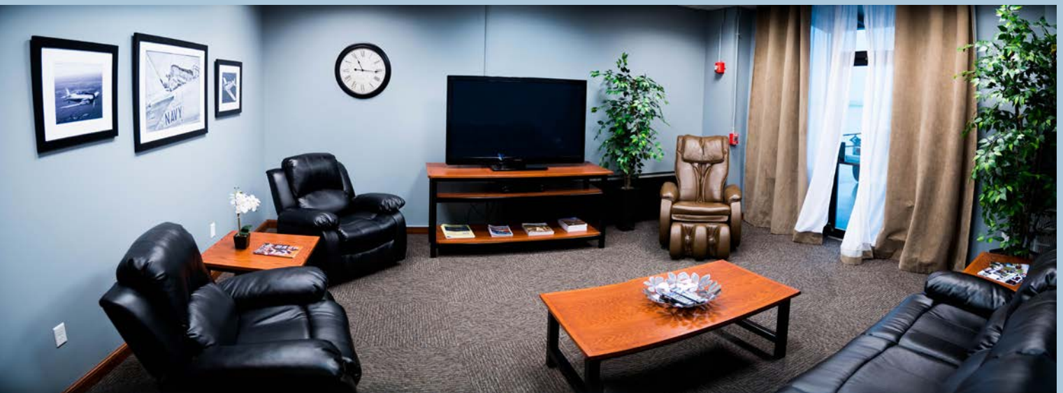
Figure 4: Pilot lounge at Hoosier Aviation