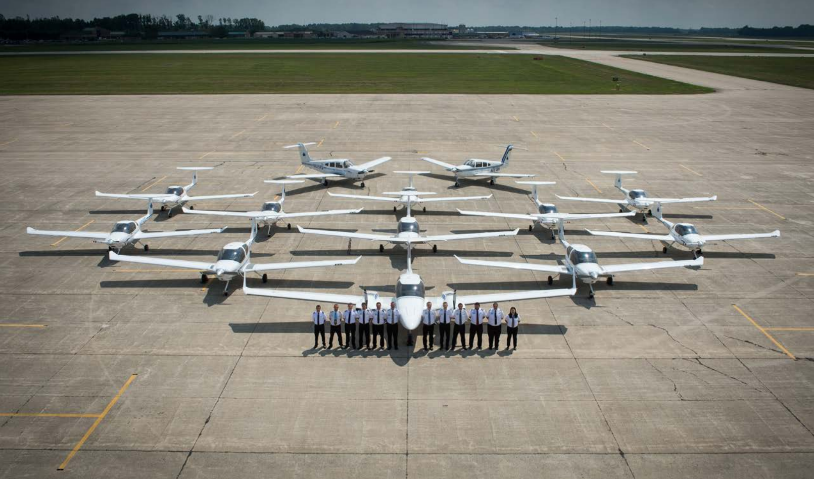
Figure 10: ISU's Fleet