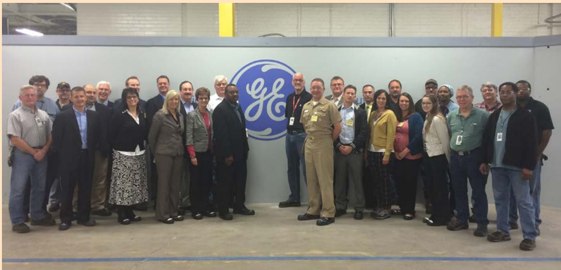
Figure 17: Tour of Terre Haute's aviation companies