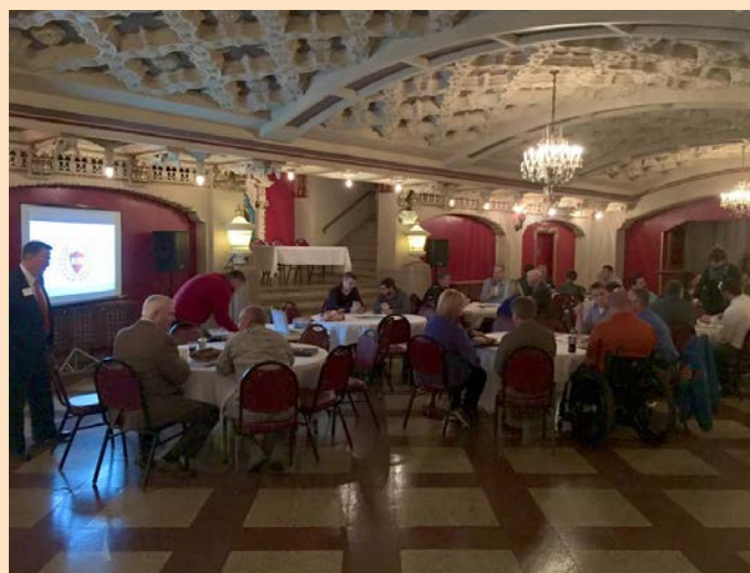
Figure 19: Airport presentation to the community