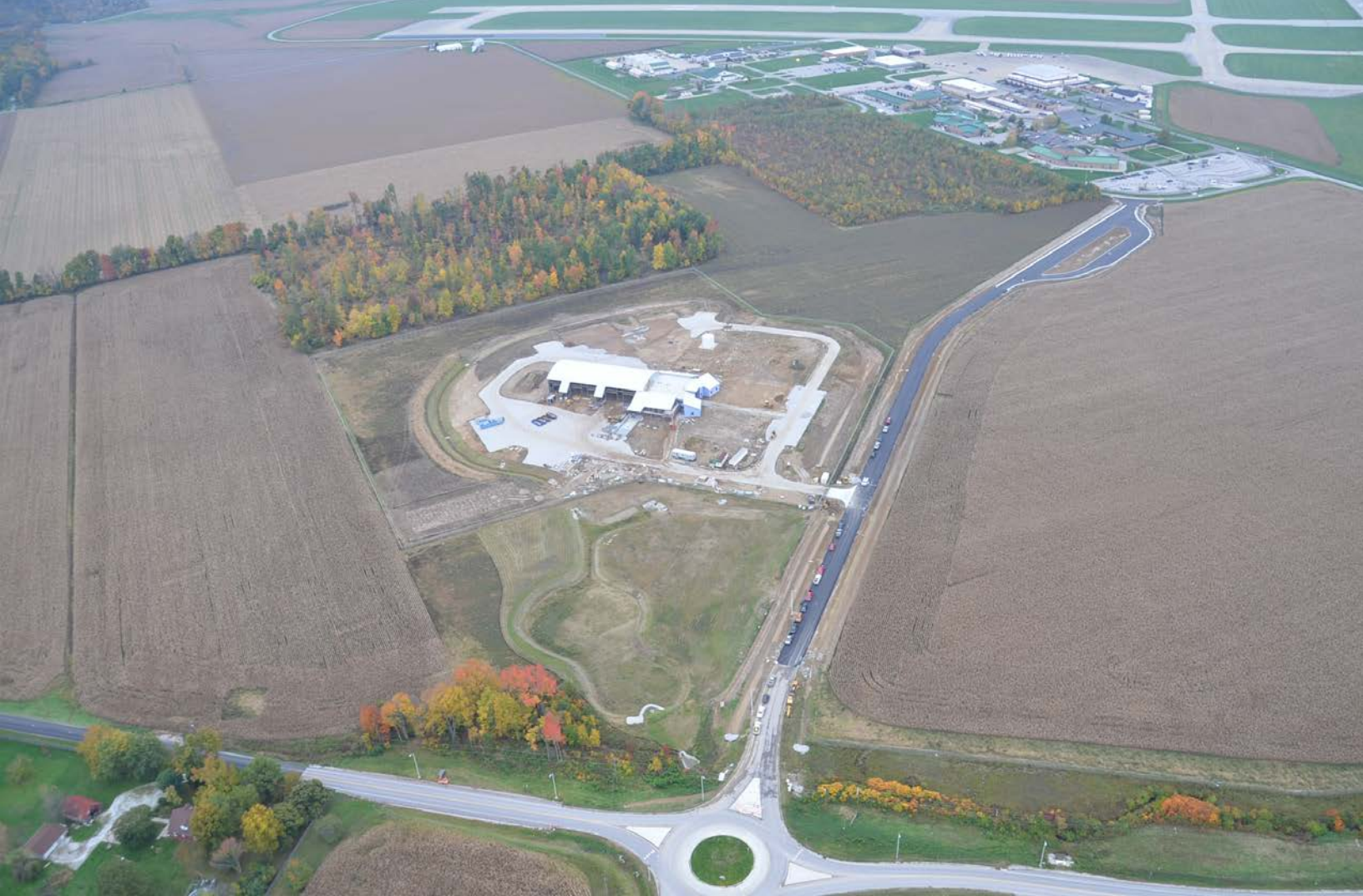
Figure 12: Army National Guard FMS #8

leaders to navigate the political climate. The organization has been actively lobbying for interests that are important to each of their respected industries. The group has traveled to Washington D.C. to meet with our elected officials, as well as the Statehouse to meet with the Governor Holcomb as well as local elected officials.