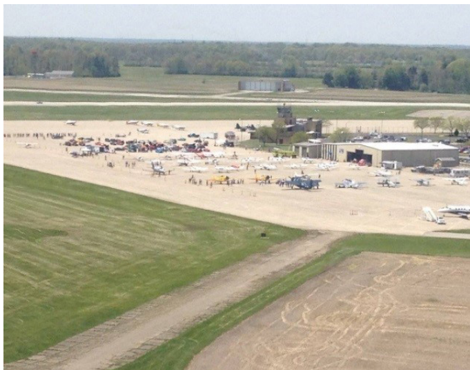
Figure 13: ISU Fly-In