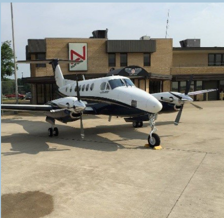
Figure 1: Hoosier Aviation's King Air 200