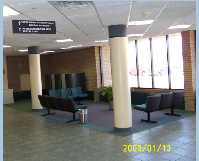
Figure 3: Interior of the terminal before the renovation