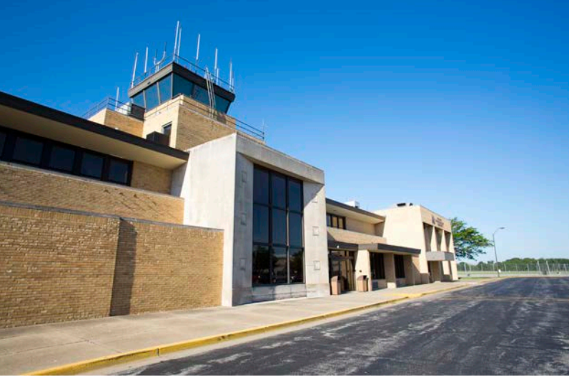
Figure 25: THRA Terminal built circa 1950s