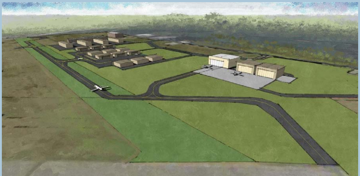
Figure 11: Renderings of proposed future development of the West Quad Area