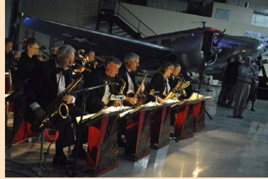
Figure 21: USO Show