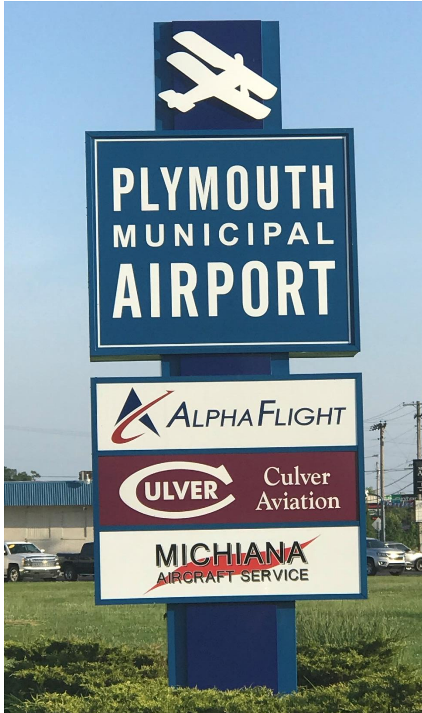
Airport sign with all three new businesses added as Tenants within the last 14 months.