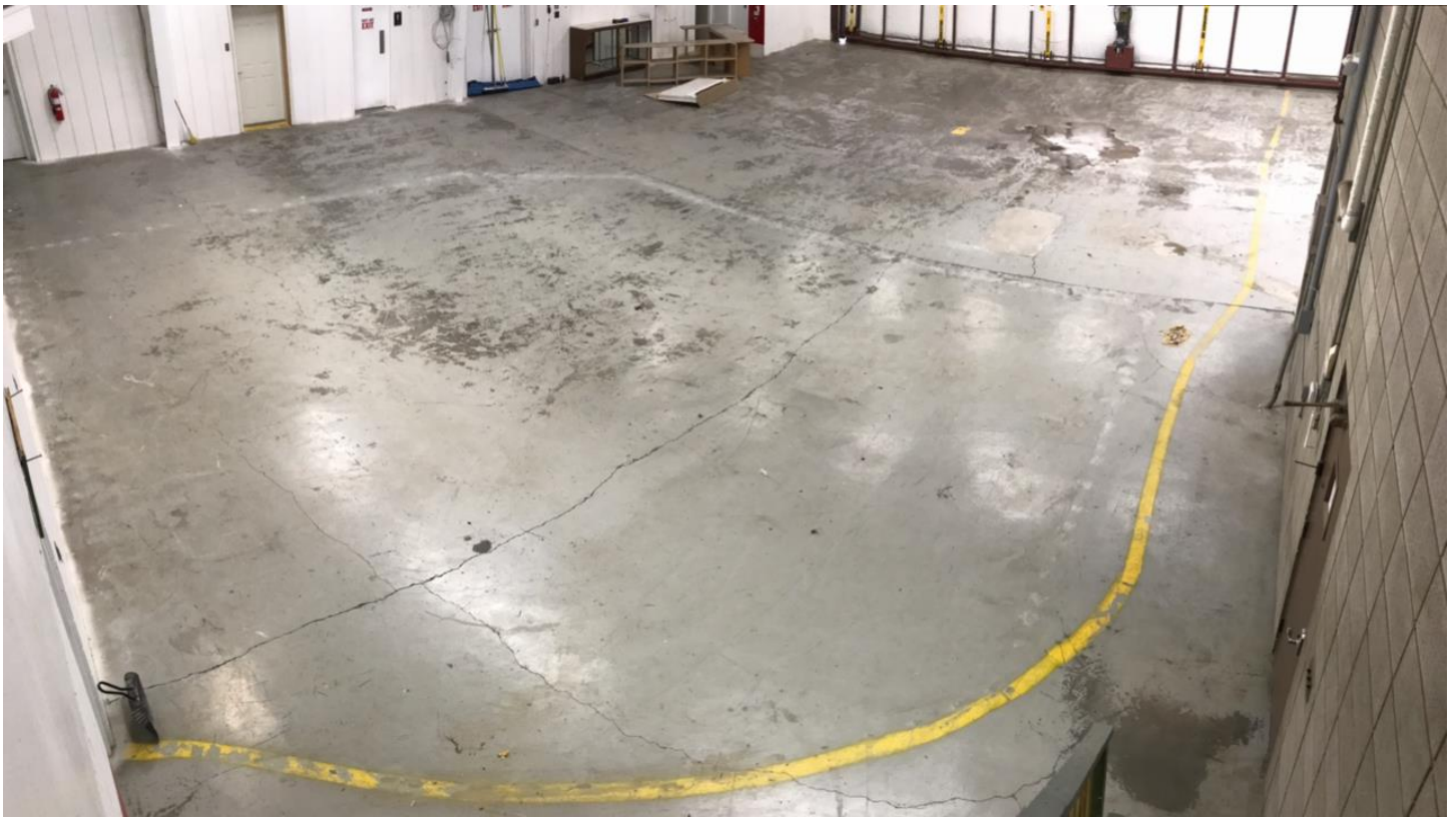
Corporate Hangar “BEFORE” and “AFTER”. All work performed by airport staff.