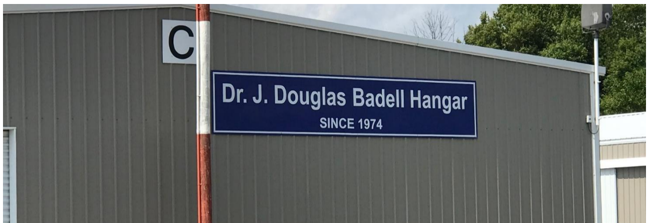
Fall 2018 honored local Pilot for his many contributions to the airport.

Several times during the year we host the Indiana State Police for training. The Motorcycle Officers use our ramp and taxiway for training and yearly testing required to stay proficient at low and high-speed maneuvers. The Canine Officers come different times of the year for contraband/drug search training and attack training. We see State Officers and Army National Guard/DEA helicopters regularly during late summer months during search and seizure operations.