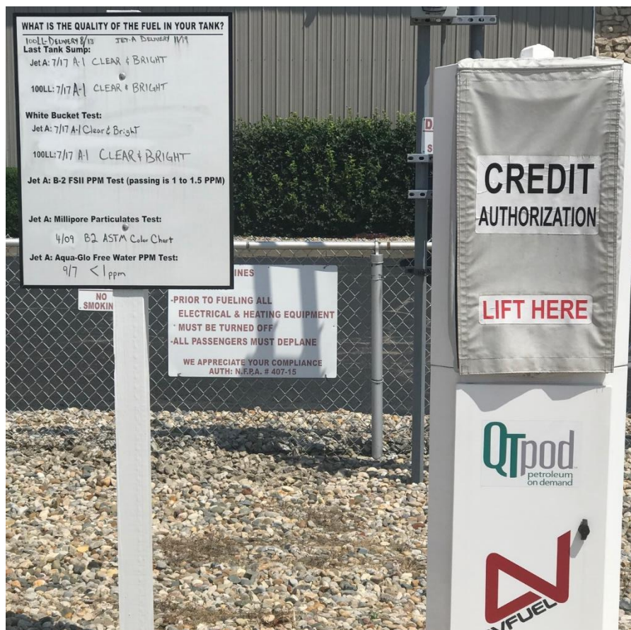
New fueling kiosk (QT Pod 4000) and fuel quality testing results posted

2017 the airport property was attached to the cities sewer system and eliminated our septic tank.