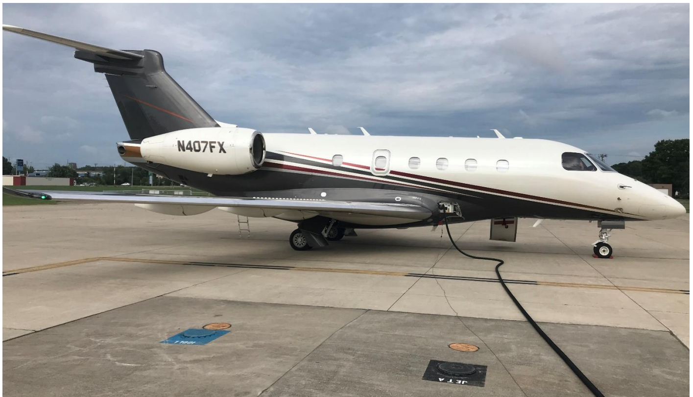
Flex Jets has become a regular visitor. Single point fueling an Embraer Legacy 450

All of these above steps will help me mentor our growing staff and students.