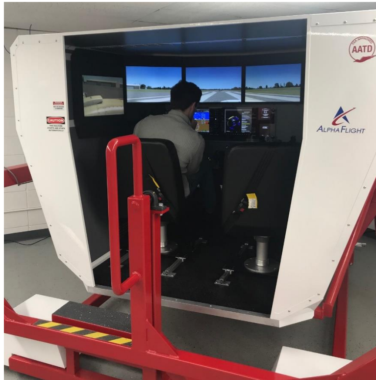
Alpha Flight CFII practicing for teaching in the Redbird MCX Simulator