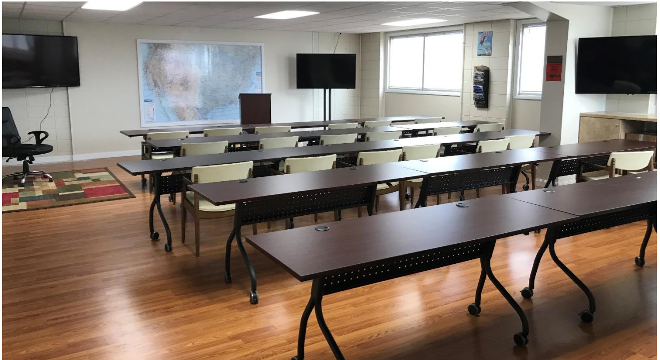
Classroom preparations underway for August 7 th start of High School Aviation program

July of 2018, we entered into discussion with the North Central Area Vocational Cooperative to add an aviation program for Juniors and Seniors of ten local high schools. This program was accepted with great enthusiasm from the community of partnering schools and helped us to convince two local businessmen to start a flight school at Plymouth Municipal Airport (Alpha Flight). This coming fall semester we are beginning the aviation program with 31 students from 7 of the partnering high schools. The students will meet in a classroom at the airport from 12:30 to 3:00 every afternoon 5 days a week studying ground school and airport operations. The students will receive 5 hours of flight instruction and 5 hours of simulator time in a Redbird MCX simulator. With actual flight time and AATD full motion simulator time this program will be one of a kind in Indiana. Ivy Tech College is partnering with us, and the high school students will receive 17 college credit hours for the first year's studies. This high school program has helped develop discussions with Ivy Tech for the possible near future placement of an Ivy Tech campus offering their full course of college aviation subjects at Plymouth.