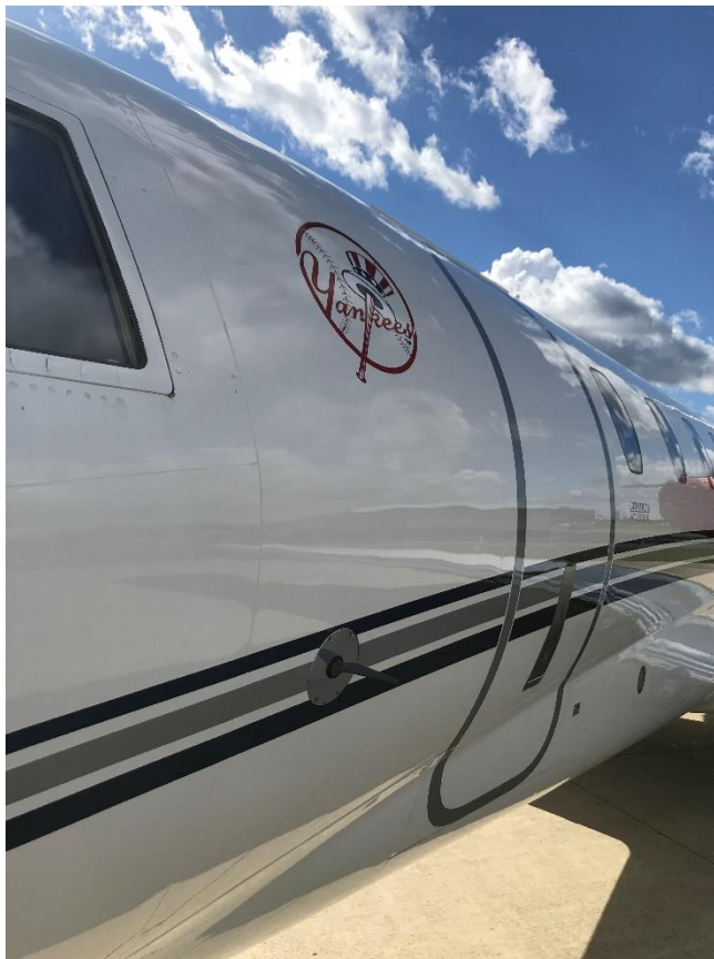
A well known regular visitor to C65

Woolpert Engineering works closely with us to keep our Master Plan and Capitol Improvement plan current. We are currently revising our ALP to reflect newly identified needs for our continued growth. A recently identified major improvement will be the building of a paved parallel taxiway which we will be pushing for groundbreaking in 2020.