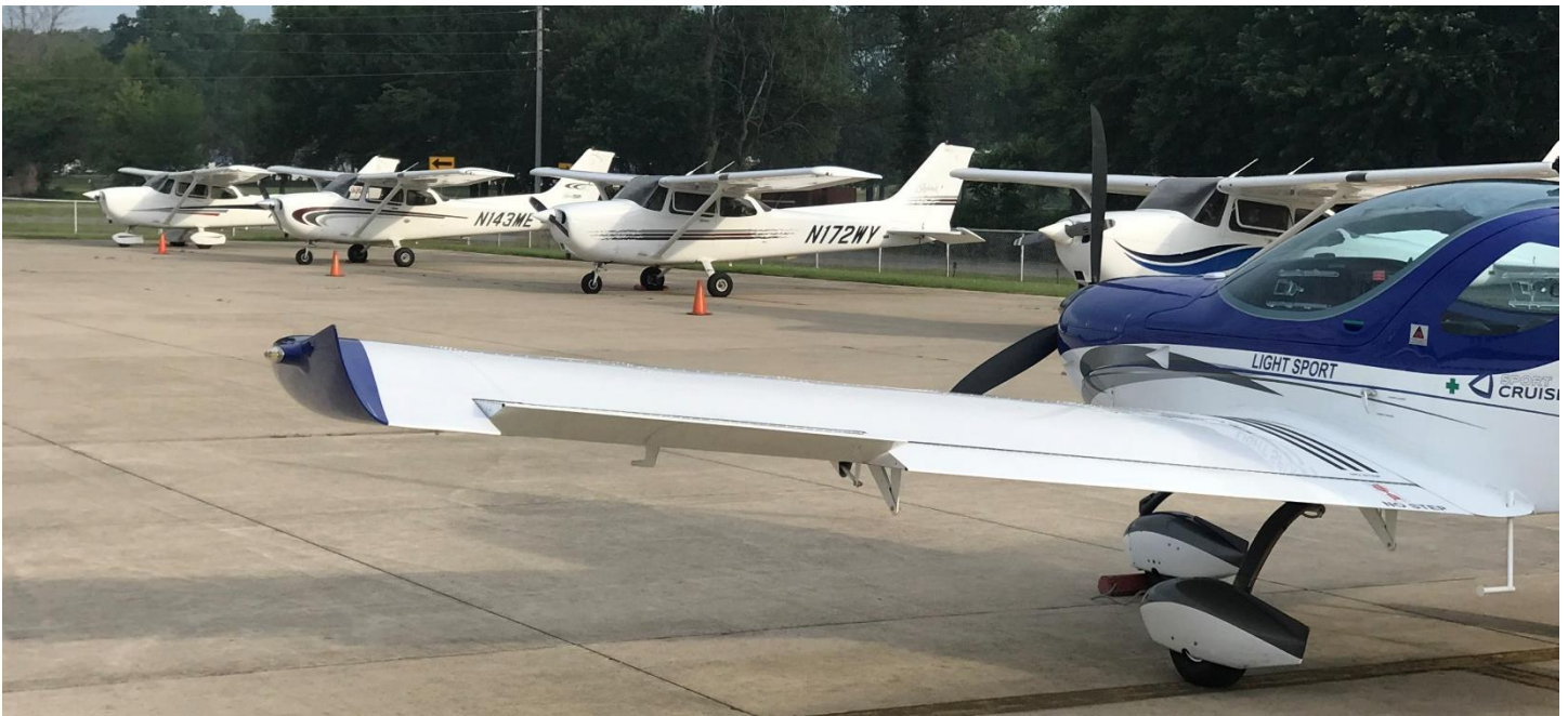
Alpha Flight aircraft staged for Culver Academies Summer Camp

Additional items that have been addressed for safety are the 2017 addition of an AWOS III system with local funds and a recent change to the airport UNICOM/CTAF frequency to a very discrete frequency. The AWOS has the benefit of offering current weather to pilots for much safer operations. The local radio frequency change was primarily for the benefit of the newly added flight schools intensive training but gives the airport a much safer approach for all traffic no longer being "Com jammed" from other area airports. This frequency change was rather easy to do and has been a major improvement for our traffic's safety.