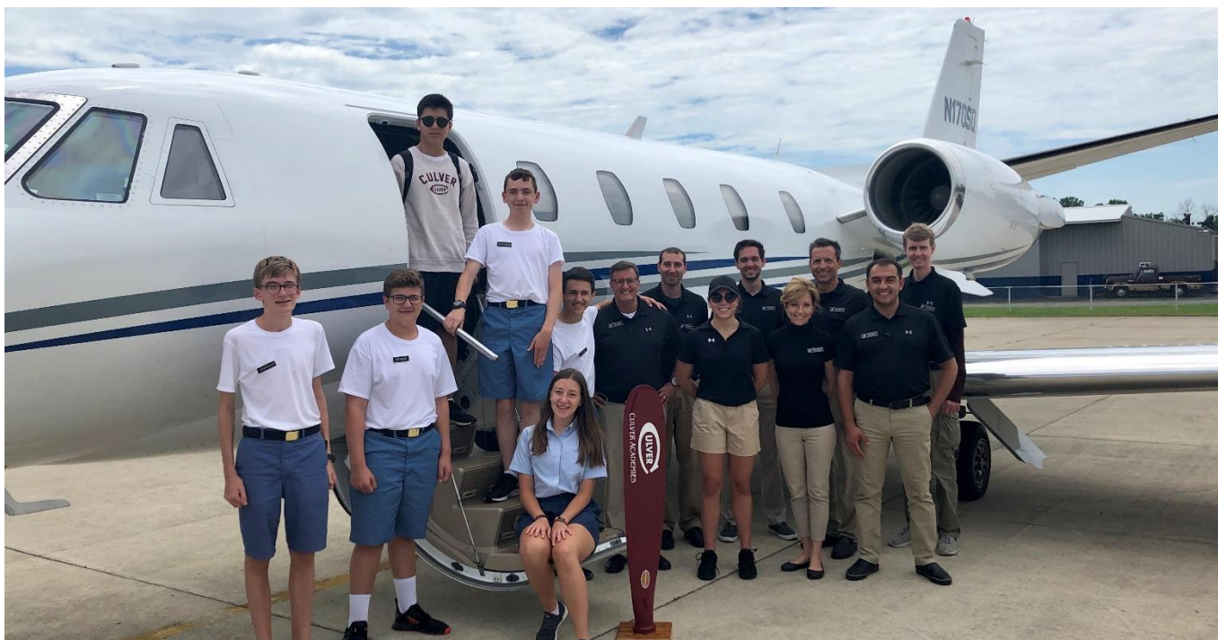
A few of the 50+ Culver Academies Aviation Summer Camp Students with the Alpha Flight Staff

The local Enterprise car rental agency is a regular benefactor of patrons flying into Plymouth as well as a local restaurant, Christo's, which is a favorite destination of many pilots.