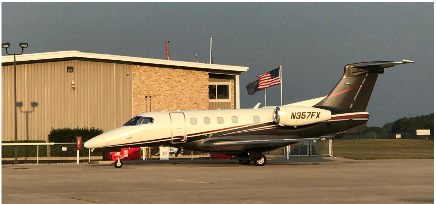
Flex Jets Embraer Phenom 300

Plymouth City Council has approved the payment to repave Airport Road in the fall of this year. We have budgeted funds for 2020 for rehabbing ramp concrete expansion joints, paving large parking area and restriping.